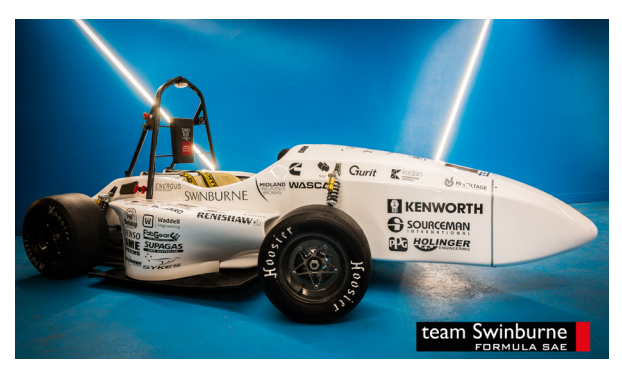
Team Swinburne Formula SAE car with its new wheel package.

One of the findings of this analysis was that the rotational inertia of the wheels during acceleration and braking was using much more energy than expected.