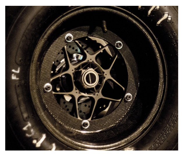
The new wheels "looked incredible" according to Ryan Wise.

A big advantage of using Renishaw's additive manufacturing technology was the ability to use titanium. "The amount of material for the initial billet, together with the machining time and experience that would be needed, had ruled out using titanium with traditional manufacturing methods," explained Ryan.