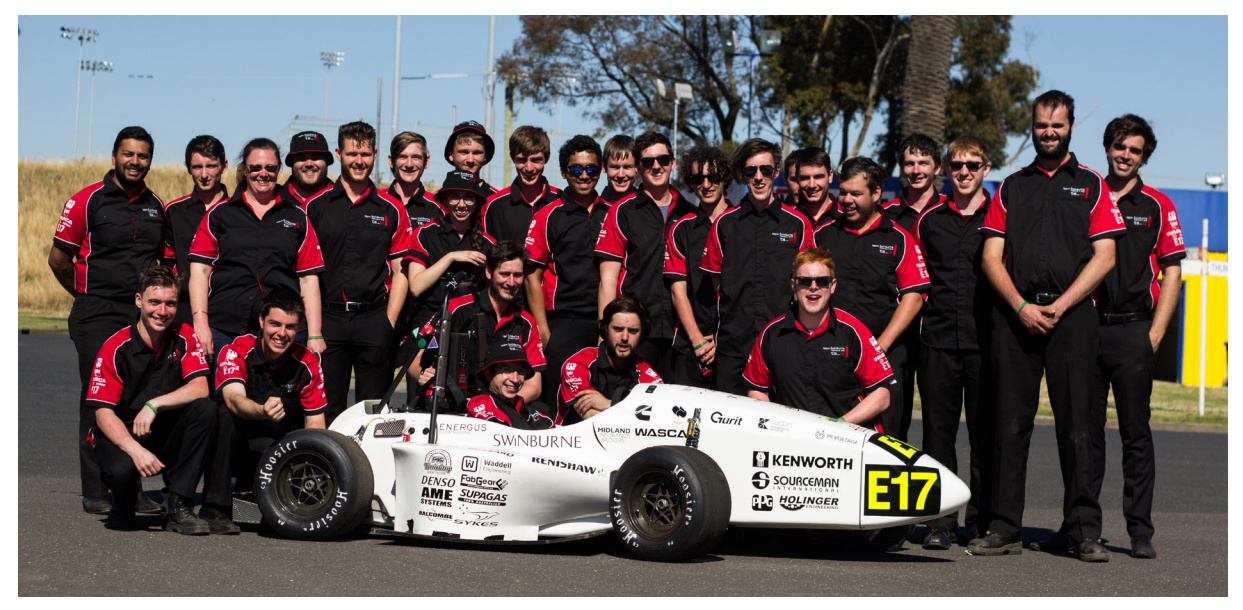
Team Swinburne with the 2016 car.

"Printing the parts required very little effort on our behalf and they were manufactured much more quickly than the last set of wheel centres that we made. I was surprised at the quality of the surface finish and that we required no finish machining."